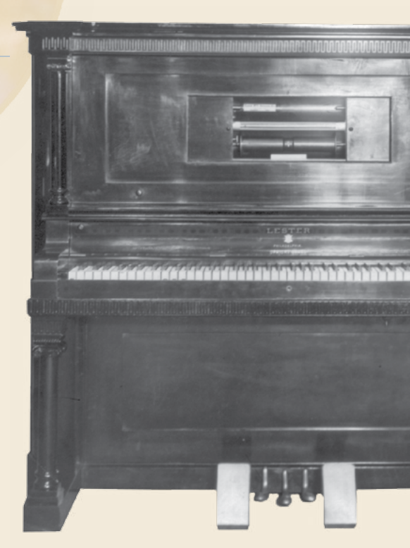
A piano that played music from piano rolls.

But within a few years of the fair, he believed that not only was domestic music endangered, but also that amateur creation of music was in decline due to